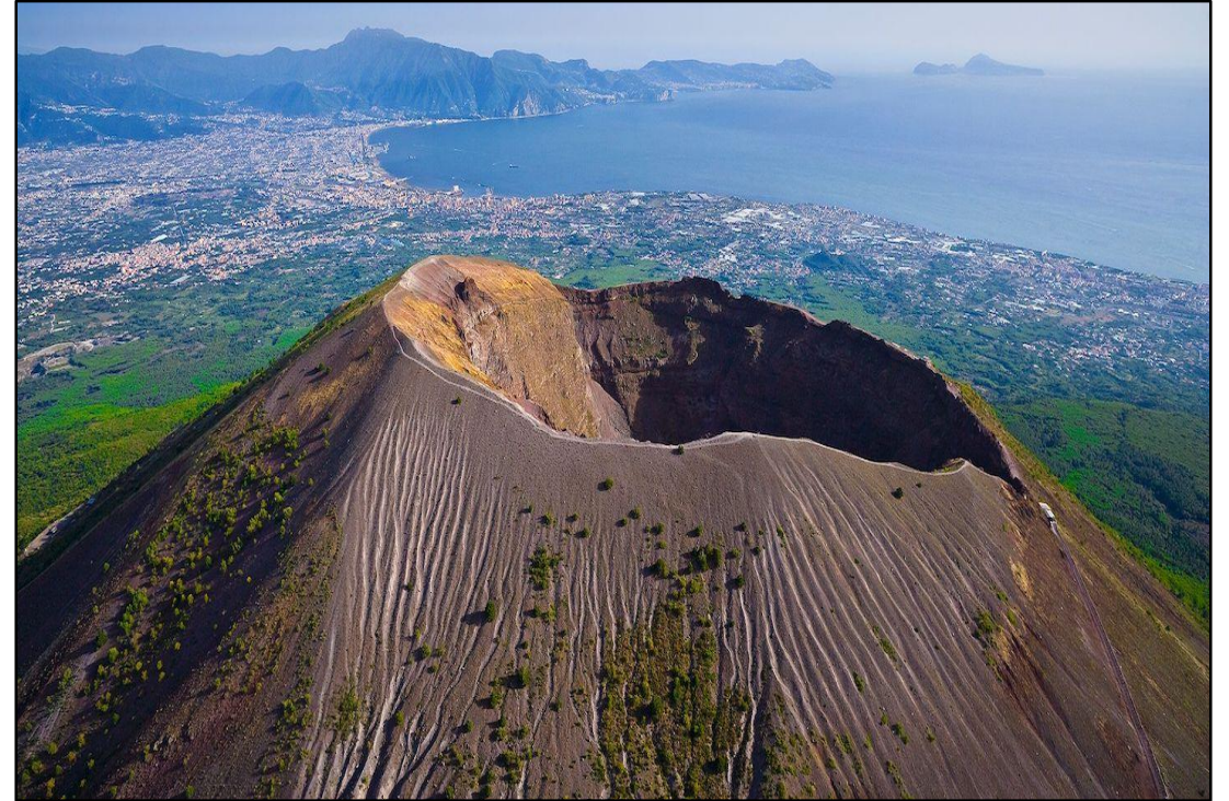
Mount Vesuvius, Italy